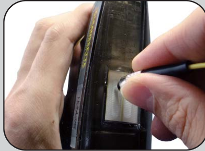
Ultra clean micro-fiber cloth captures debris and other contamination