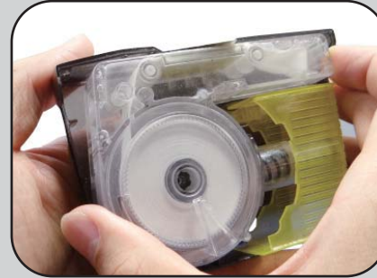
Easy to remove cleaning reel without cause any contamination