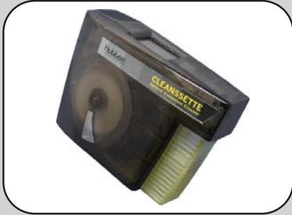
CLEANSSETTE—Optical connector cleaner in cassette design