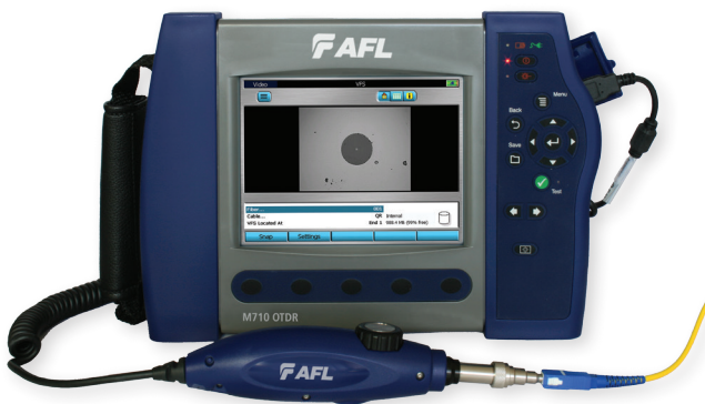
M710 OTDR with DFS1 Digital FiberScope