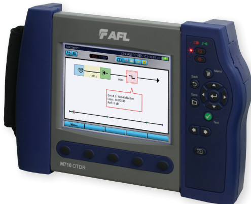
M710 Compact QUAD OTDR